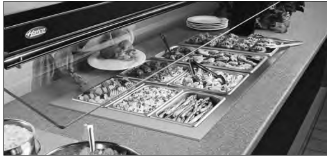
Model HWBI-4MA with accessory food pans

▲ For HWBI-FUL (HWBI-1) and HWBI-FULD (HWBI-1D), see Form No. HWBI-FUL Spec Sheet