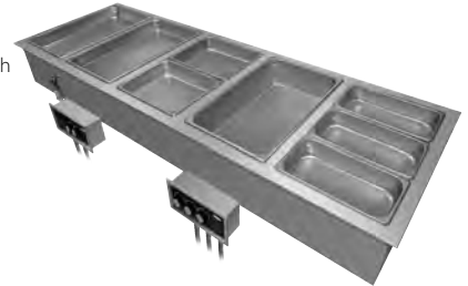
Model HWBI-5MA with accessory food pans